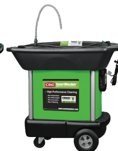
SW-37 Mobile Heavyweight Parts Washer