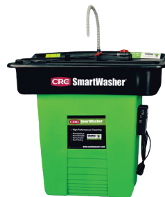
SW-28 SuperSink Parts Washer