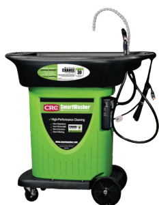
SW-23 Mobile Parts/Brake Washer