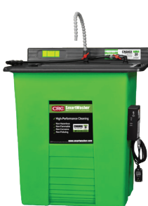
SW-25 Signature Parts Washer